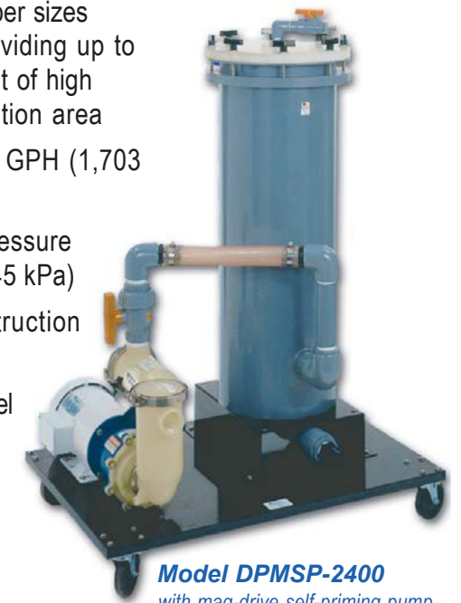
Model DPMSP-2400 with mag-drive self-priming pump